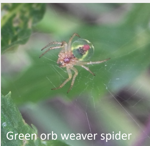
Green orb weaver spider