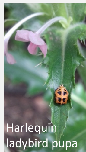
Harlequin ladybird pupa