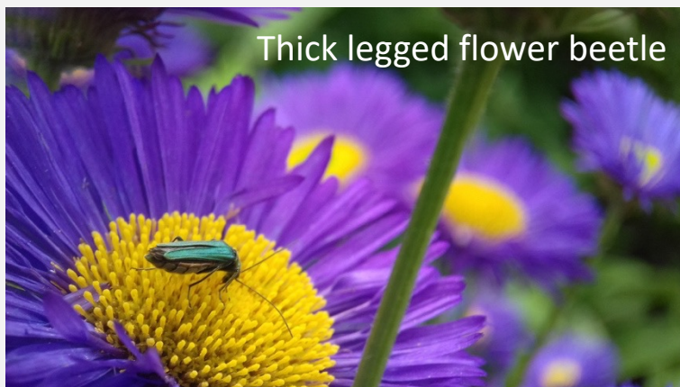
Thick legged flower beetle

Photos on site June/July 2021 (identification approximate!)