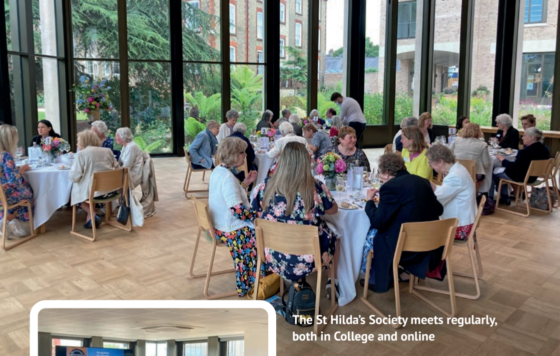
The St Hilda's Society meets regularly, both in College and online