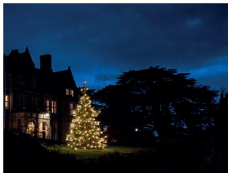
'Oxmas' at St Hilda's

I am honoured to have been the JCR President of St Hilda's College this year. I am so proud of the JCR Committee for