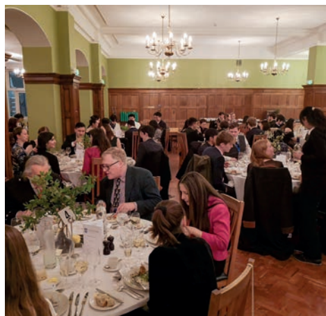
Students and staff enjoying the Green Feast