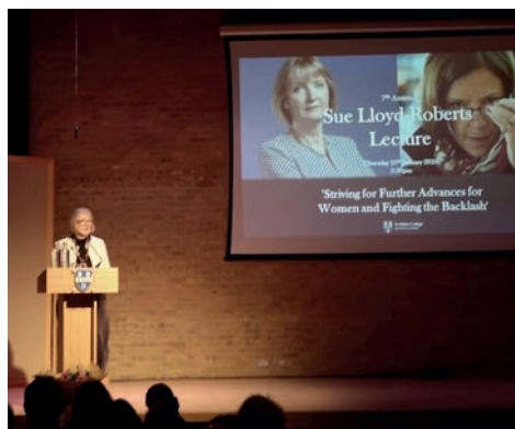
The Rt Hon Harriet Harman PC KC delivering the Sue Lloyd-Roberts Lecture