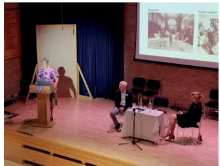
The Principal, Development Director and Senior Tutor's panel session at the Gaudy