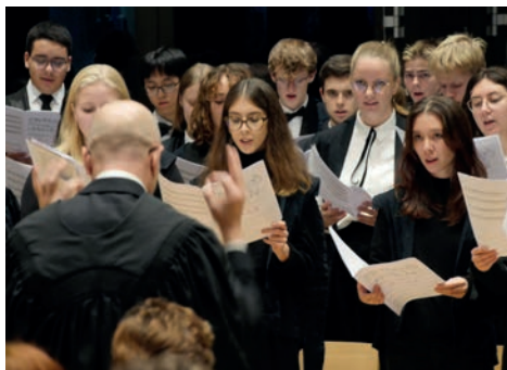
The Choir performing at Founder's Day