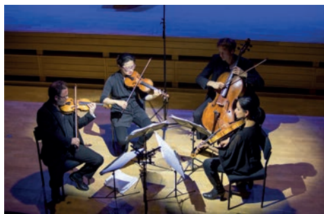
The Villiers Quartet performing in the Jacqueline du Pré Music Building

That certainly sets a very high bar for the current JdP Committee members and fundraising team to emulate. Nevertheless, a great deal of energy has gone into ensuring that as many as possible of our College alumnae, friends and the local community experience the wide array of talent that will perform across the