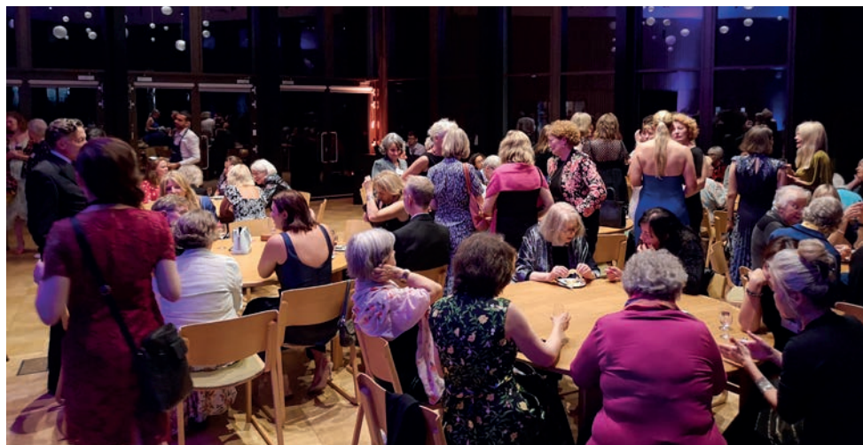
Senior Members gathered in the Pavilion at the Gaudy