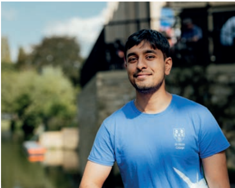
As ever, numerous students came forward to volunteer for the open day

A new initiative in October 2023 was the soft launch of the St Hilda’s Visiting Student Programme, starting with four high achieving students from international universities coming to study a course at the undergraduate level for the full academic year. The Visiting Student