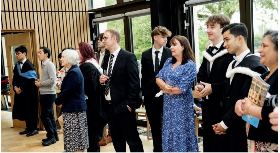
MCR and JCR members with their families at a graduation celebration in the Pavilion

significant event of the year was the MCR Academic Conference in April, featuring 19 talks by MCR members. The talks discussed the theme 'Life and Death' from every angle imaginable, from ethnomusicology, to medicine, to education, to French literature, to seabird biology. In all honesty, I have never attended a conference with such a high level of audience engagement.