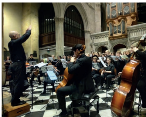
'Come and Sing', with students and alumnae

their enthusiastic commitment to their roles, and for enabling the growth and success we achieved together. I am also personally grateful to the College staff and Senior Members for their invaluable support and encouragement during my term. I feel incredibly lucky to be a part of the wonderful St Hilda's community, and I cannot wait to see what the JCR does next!