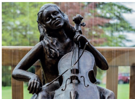
Sculpture of Jacqueline du Pré

The contents of those plastic bags are now boxed in the College archives. The plans and letters are proof of the drive to see the project completed. As early