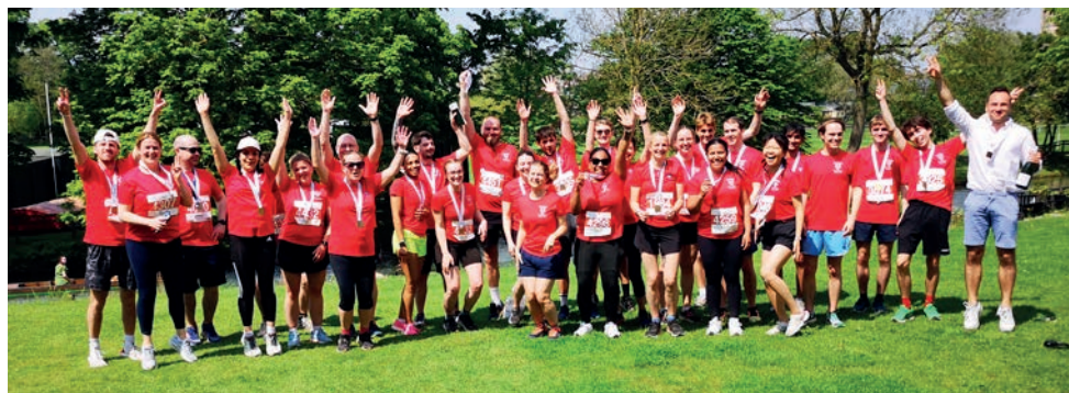
Students and staff in the St Hilda's Town and Gown team

The start of Hilary 2024 brought renewed spirit to the JCR, along with a refurbished pool table, setting the scene for the committee to eagerly tackle the annual constitutional review. Countless hours of careful deliberation gave way to a third welfare committee representative, anonymous online voting, and accessibility requirements for advertisements and posters. Welfare week provided a mobile farm and Knoops hot chocolate, while Holi, brimming with colour, more than compensated for the classic Hilary weather. 'Come and Sing' was a fitting term finale exhibiting