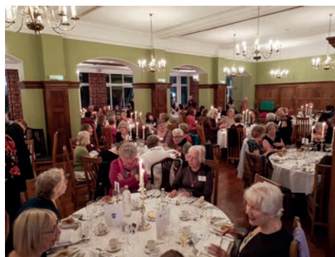
Senior Members at the Gaudy Dinner in the Dining Hall

Beyond the JdP, I am pleased to report that the College has enjoyed a fantastic year of alumnae events. These include: