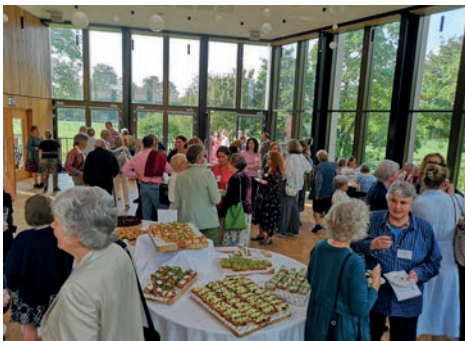
Senior Members enjoying afternoon tea with the ASM Committee at the Gaudy

Today, we have a stunning annual music calendar that varies from undergraduates performing, individually and collectively, on various instruments, during termtime to the weeks in between, upholding the College's values of Excellence and Equality at all times. I confess that I am a great fan of the weekly Thursday lunchtime concerts in term, when the audience can drift off to their imaginary desert islands, uplifted by half an hour of student musical talent. It is an extraordinary privilege. As I reflect upon these concerts, and student performances of drama, and their own compositions in music