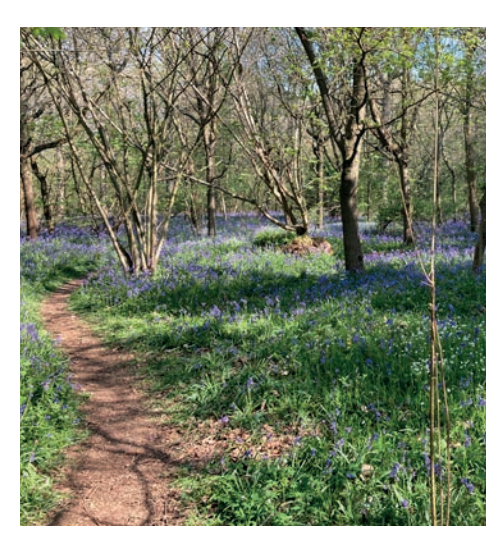
Radley Large Wood

Having completed the purchase of Radley Large Wood, which covers an area of 55 acres, in March 2022, we look forward to upholding sustainable and best practice forestry management as responsible custodians under the DEFRA Countryside Stewardship Scheme. Mobilising our students to explore the living laboratories around them in our gardens and grounds within College properties as well as in the wood, and contributing to establishing