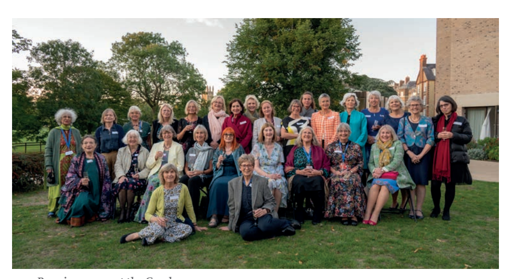
1972 Reunion group at the Gaudy

The new year will see some changes to the role of the ASM Committee: in particular we will be more active in bringing year groups together to celebrate key anniversaries. We will be looking for new members, particularly those with anniversary years coming up who are keen to help celebrate, so please do get in touch with the Development Office if you're interested!