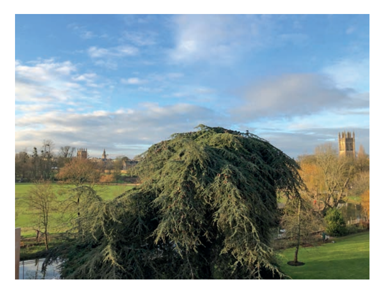
The view from the new MCR in the Anniversary Building

to talk with alumnae and learn about their valuable experiences in different careers.