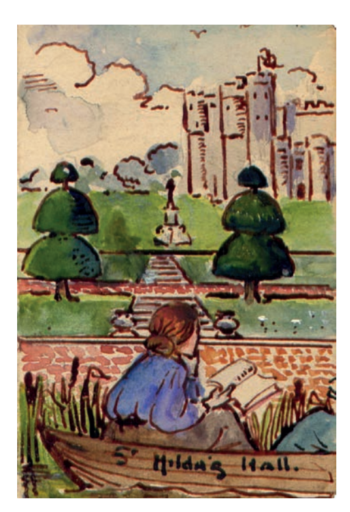
JCR social programme c. 1901. For the preservation of paper a temperature range of 16–21C is recommended, with relative humidity around 45-55RH. There a variations in this range for photographs, newspaper cuttings and tape.