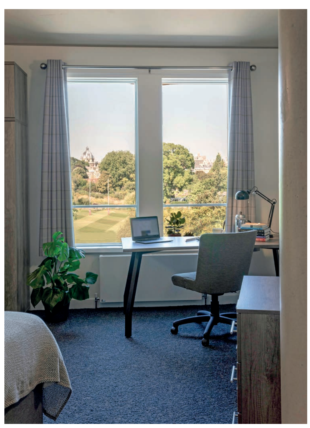
Students living in the Anniversary Building have some of the best views in Oxford to accompany their work