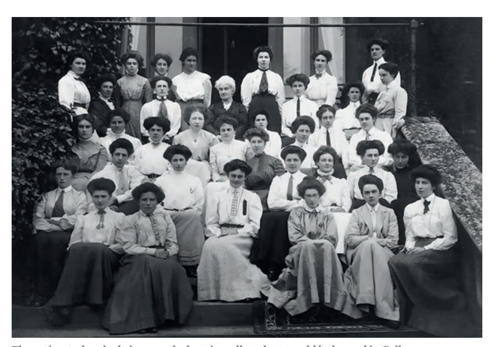
The entire student body in 1909, the last time all students could be housed in College rooms

We now have a classic listed property on St Giles', as well as a potential future graduate centre at Norham Gardens, very close to the University Parks. Offering