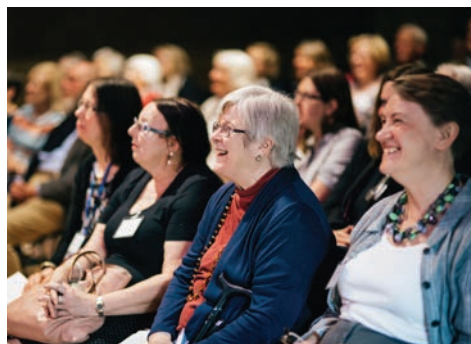
A delighted audience at the Living History screening

The Career Networks run by Senior Members flourish. A brief summary of the 2018 events: