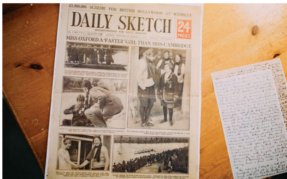
1920s room, featuring the Daily Sketch and a handwritten letter - the email of its time