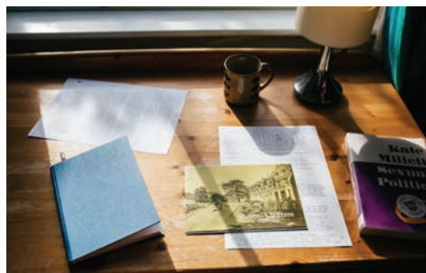
1970s room, featuring Sexual Politics by Kate Millett and a copy of Red Light