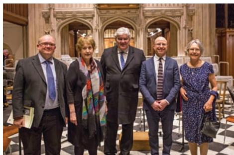
Wendy Cope and Nicola LeFanu at the premiere of St Hilda of Whitby: A Cantata