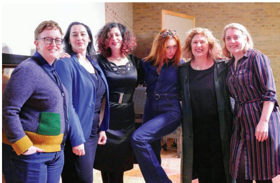
The original stars of College Girls reunited for a special screening of previously unseen footage