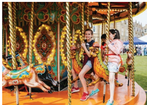
Young guests enjoying the carousel at the Garden Party