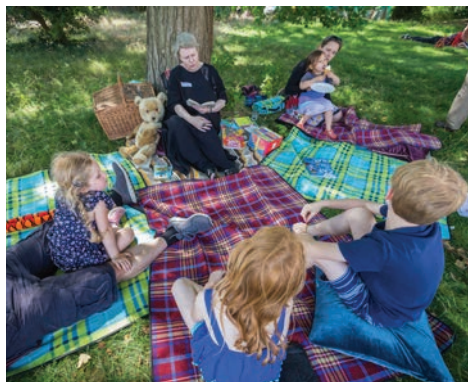
Storytelling at the 'Teddy Bears' Picnic' Garden Party