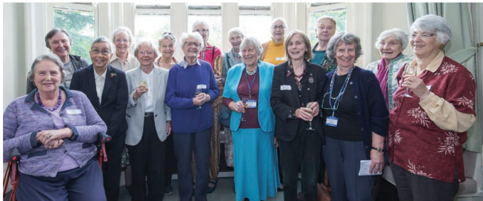
Smiles all round for the class of 1957 at their 60 th Reunion