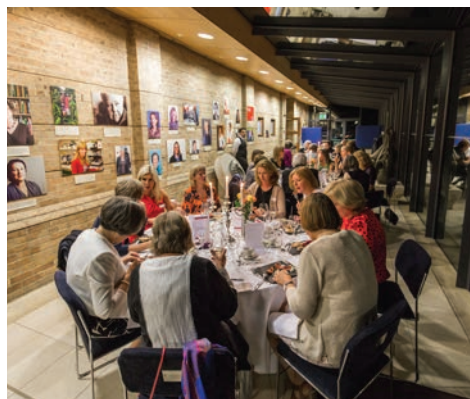
Dinner under the stars in the JdP Foyer for the 40 th Reunion