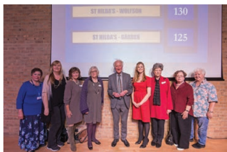
Bamber Gascoigne returned to his role as quizmaster at the Gaudy

extremely grateful to them both for so generously reducing their fees to create something that promises to be a unique and exciting part of the celebrations. The world premiere will take place on Sunday 18 February 2018 as part of the official College 125 th Anniversary Celebrations.