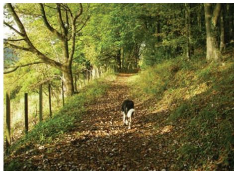
Sheepscombe Beechwoods, Gloucestershire

In the poem Old Thought , Gurney is not passively describing the landscape, he is pouring out the experience of being there. The poem is filled with that exuberance and the uprising of joy aroused by the movement in outdoors. ‘O up in height, O snatcht up, O swiftly going’ – the arrangement of each statement in Old Thought forces us to breathe faster like a runner on the steep hillside, but the whole experience is welcomed – ‘breathing is loving’. We are taken along at this fast pace, smelling the leafy earth, pushing aside brambles, glimpsing with Gurney the high cirrus clouds above the Cotswold Edge