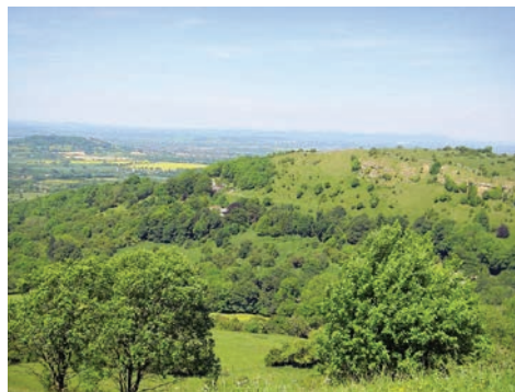
Crickley Hill, Gloucestershire (The High Hills)

to the memory of wind rising on the Cotswold ledges nevertheless behind and beyond him is not Gloucestershire but the asylum walls and himself. Gurney is out of place and so he cannot reproduce the performance of being in place, only comment on it as an outsider.