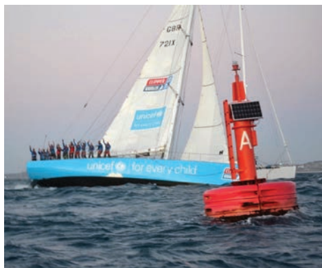
Unicef crosses the finish line victorious at Fremantle

water, or being seasick yet again, I do tend to question my judgement in having voluntarily subscribed to this. But secretly, I think I enjoy nearly every minute.