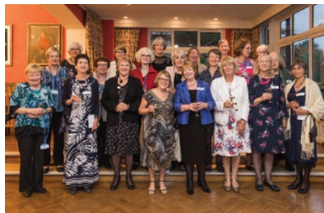
The stylish class of 1967 at their 50 th Reunion

The Treasurer thanked the Development and Alumnae Relations team for the excellent online versions of the publications, which disseminate the same information electronically.