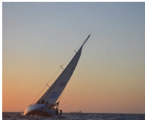
Unicef sailing to victory in an Australian sunset

Despite this, to my surprise sailing is also exhilarating, rewarding and fun. I expected to be glad to get off in Cape Town for a break, but I wanted to head straight back out there after my first leg! When I am knee-deep in the bilges, scooping up dirty