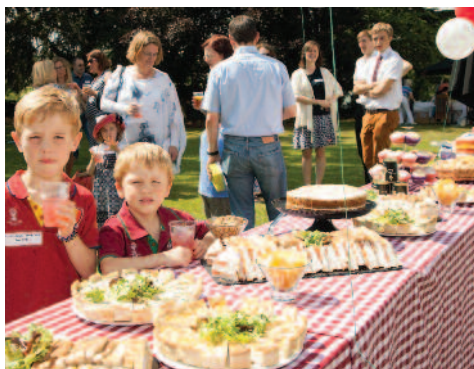
The Garden Party