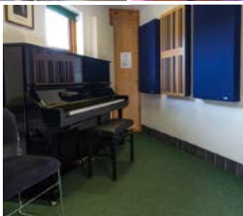
Mackinnon Practice Room