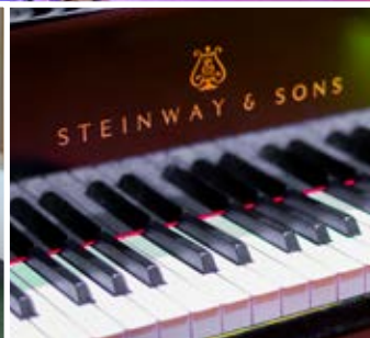
Stevenson Practice Room

The Salmon Room contains a Yamaha U3 upright piano and is the ideal space for individual practice or teaching. The Lee Room contains two upright pianos, which suits piano teaching, duo work and normal practice sessions. All rooms have piano stools, chairs, and music stands.