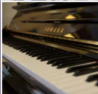
Salmon & Lee Practice Rooms