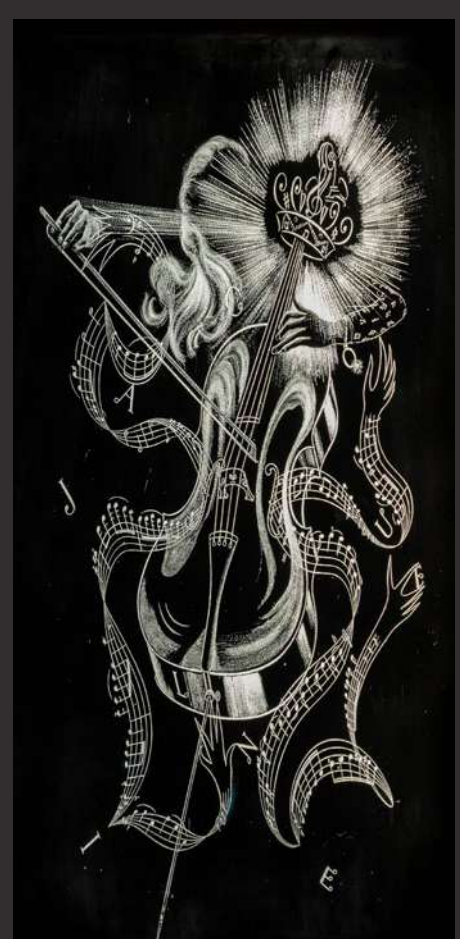
Brochure design by Joel Baldwin © 2017