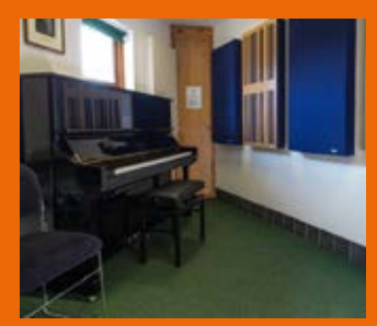
Mackinnon Practice Room

The Salmon Room contains a Yamaha The Mackinnon Room contains a brand The Stevenson Room is larger than the rooms have piano stools, chairs, and ideal practice space for all instruments. music stands.